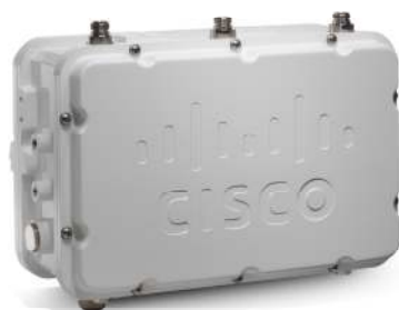
Figure 1. Cisco Aironet 1522

The Cisco Aironet 1522 supports dual-band radios compliant with IEEE 802.11a and 802.11b/g standards. Various uplink connectivity options are supported such as Gigabit Ethernet (1000BaseT), and small form-factor pluggable (SFP) for fiber (100BaseBX) or cable modem interface. Power options supported includes 480VAC, 12VDC, cable power, Power over Ethernet (POE), and internal battery backup. It also employs Cisco's Adaptive Wireless Path Protocol (AWPP) to form a dynamic wireless mesh network between remote access points, while delivering secure, high-capacity wireless access to any Wi-Fi-compliant client device (Figure 2).